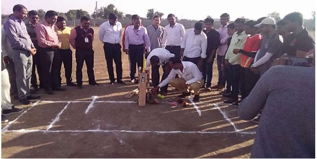
AIMBA Girls cricket Team