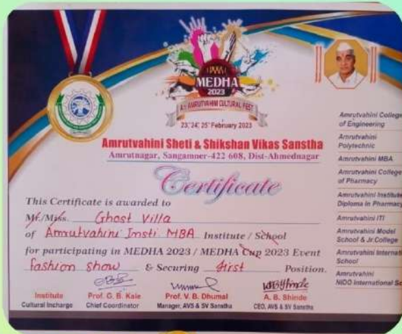
Fashion Show First Prize 🏆