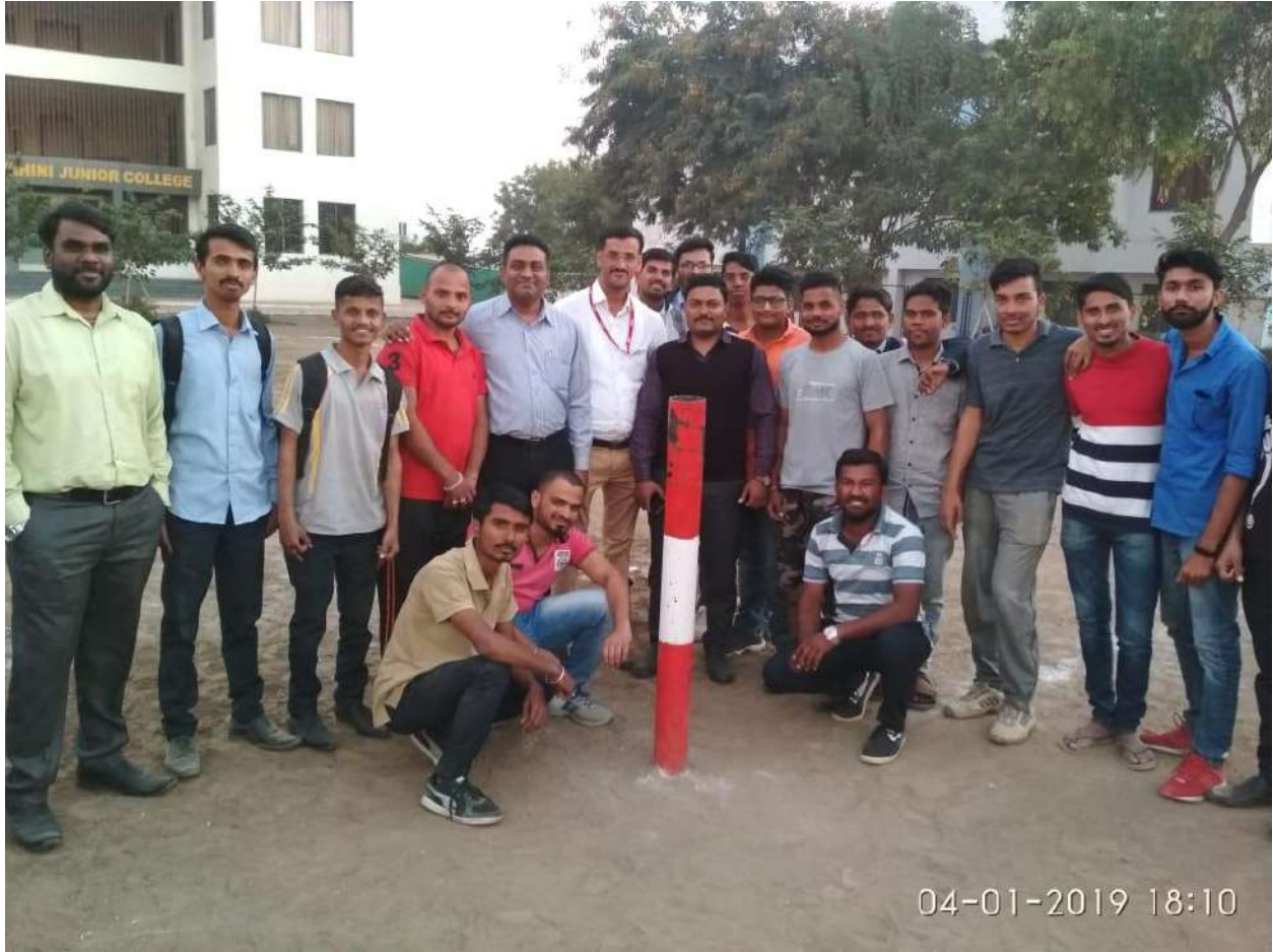
AIMBA Boys & Girls KHO-KHO Team