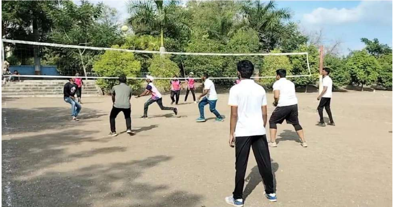
AIMBA Volleyball Teams