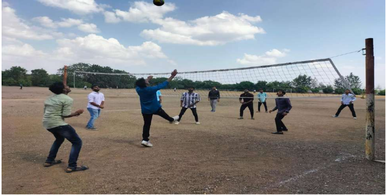
AIMBA Students Playing Volley-Ball