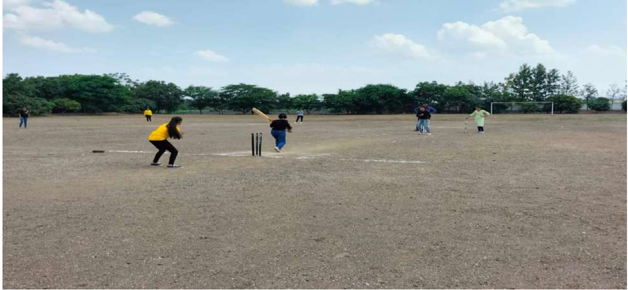
AIMBA Girls Playing Cricket