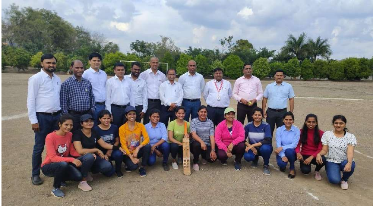
Girls Cricket Team MBA-I & MBA –II