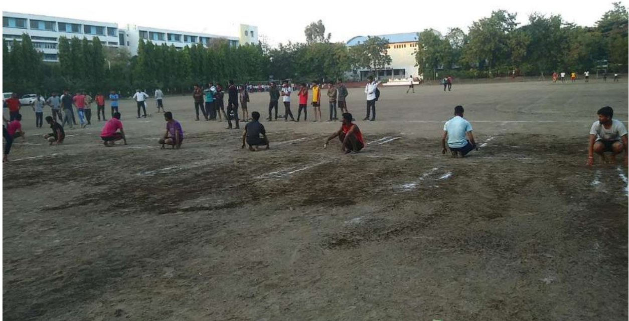
AIMBA KHO-KHO Team